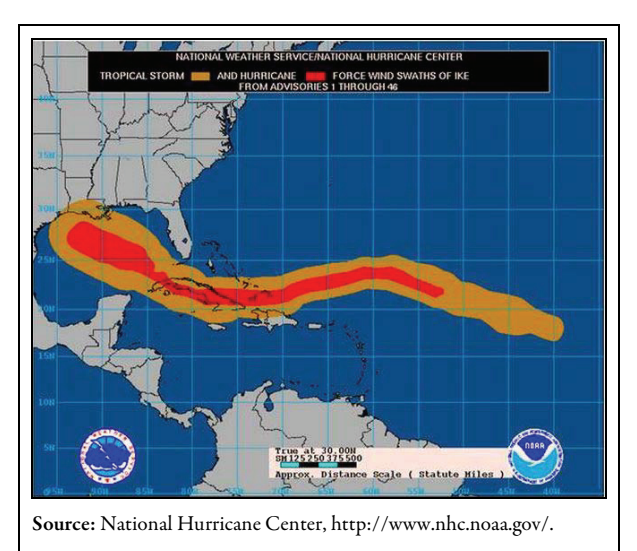
Figure 2. Tropical Storm and Hurricane Wind History of Hurricane Ike, 2008

Although no specific reports are available, Cuba's citrus juice processing facilities in Jagüey Grande in western Matanzas province almost certainly sustained major damage from Hurricane Ike. The Cuban government reported that its large fruit processing facility in Ciego de Avila in central Cuba was severely damaged by the storm. These developments will detri-